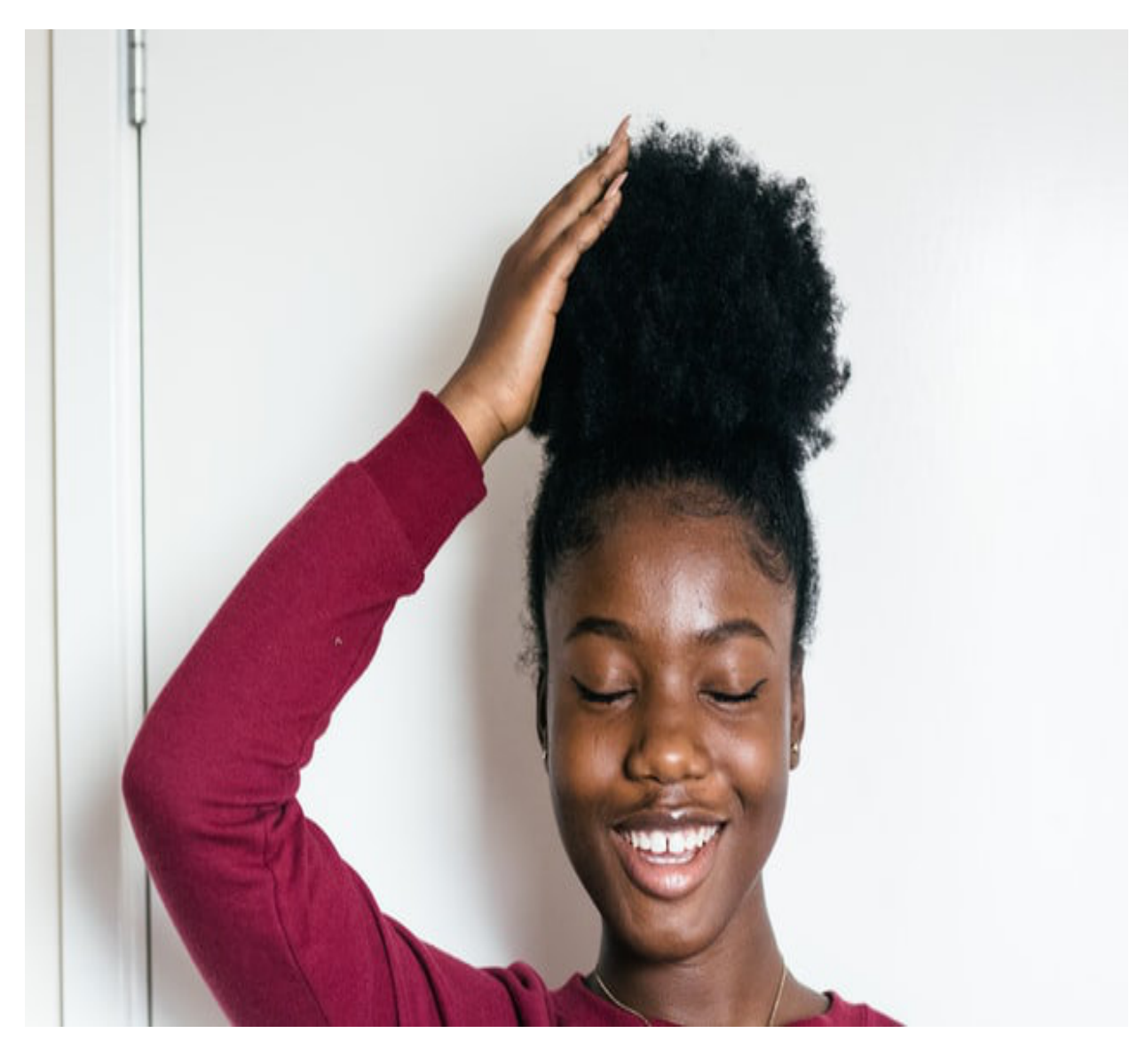
Yeye ana pua moja.