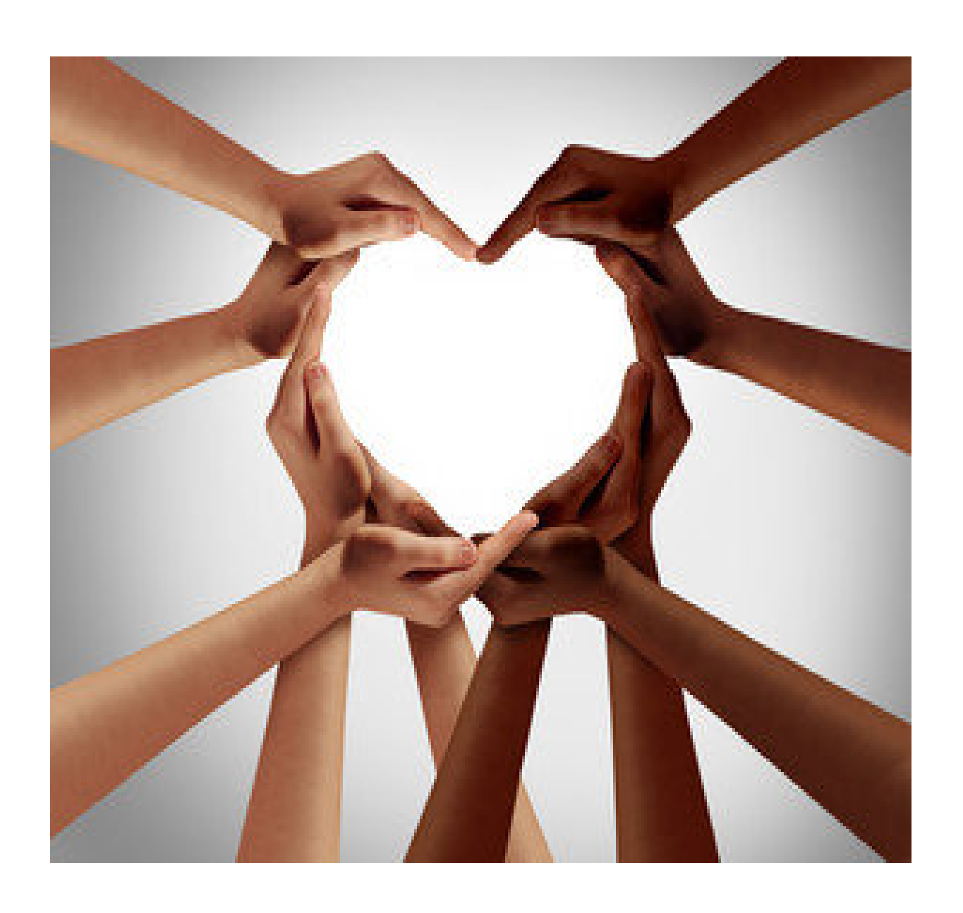
Always Choose Love Choose Respect Choose Kindness