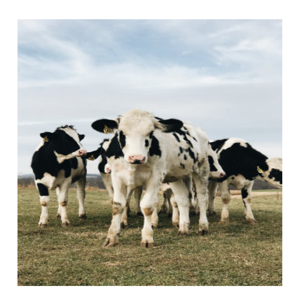
Wao wanalia, " moooo". They make the sound, "moooo" Ninyi ni sawa. You are equal.