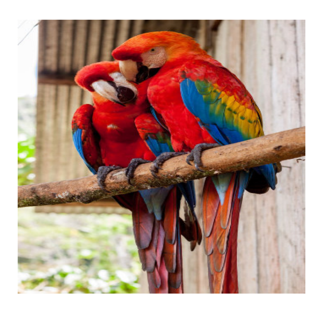
Sisi tuna macho mawili. We have two eyes. Sisi ni ndege. We are birds.