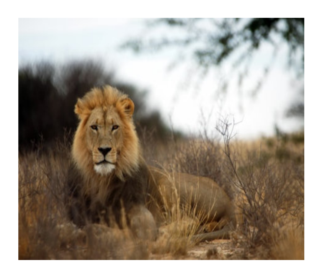
Mimi ni simba I am a lion.

Mimi ni mfalme. I am a king. Sisi tunapendana. We love each other.