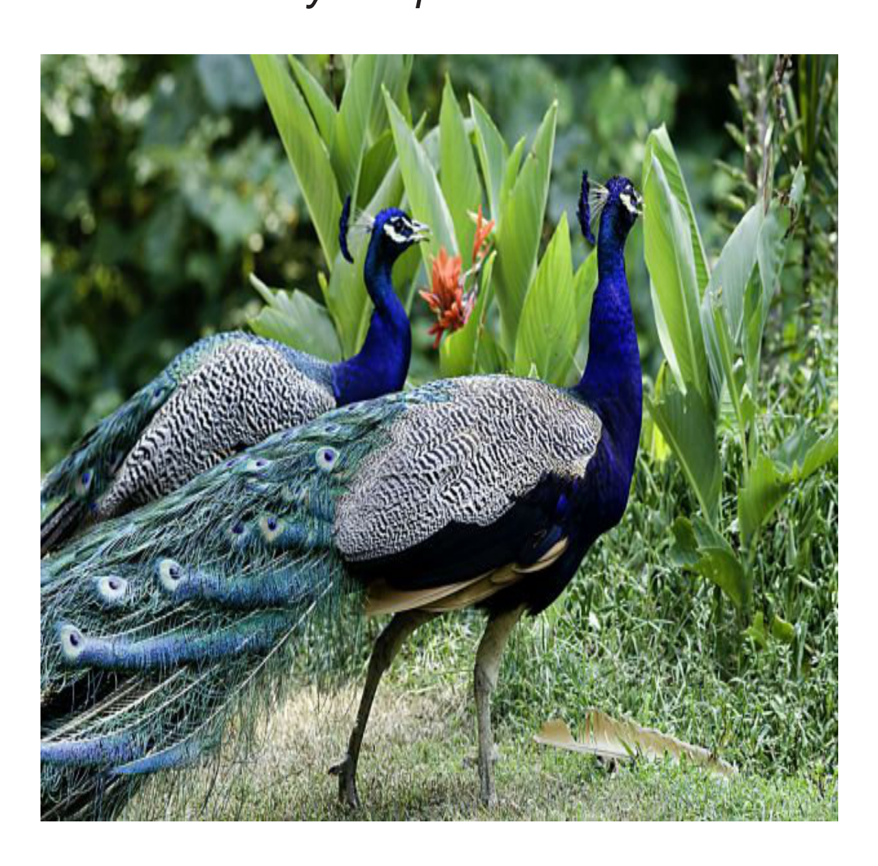
Wao wana macho mawili pia. They have two eyes too. Sisi ni sawa. We are equal.