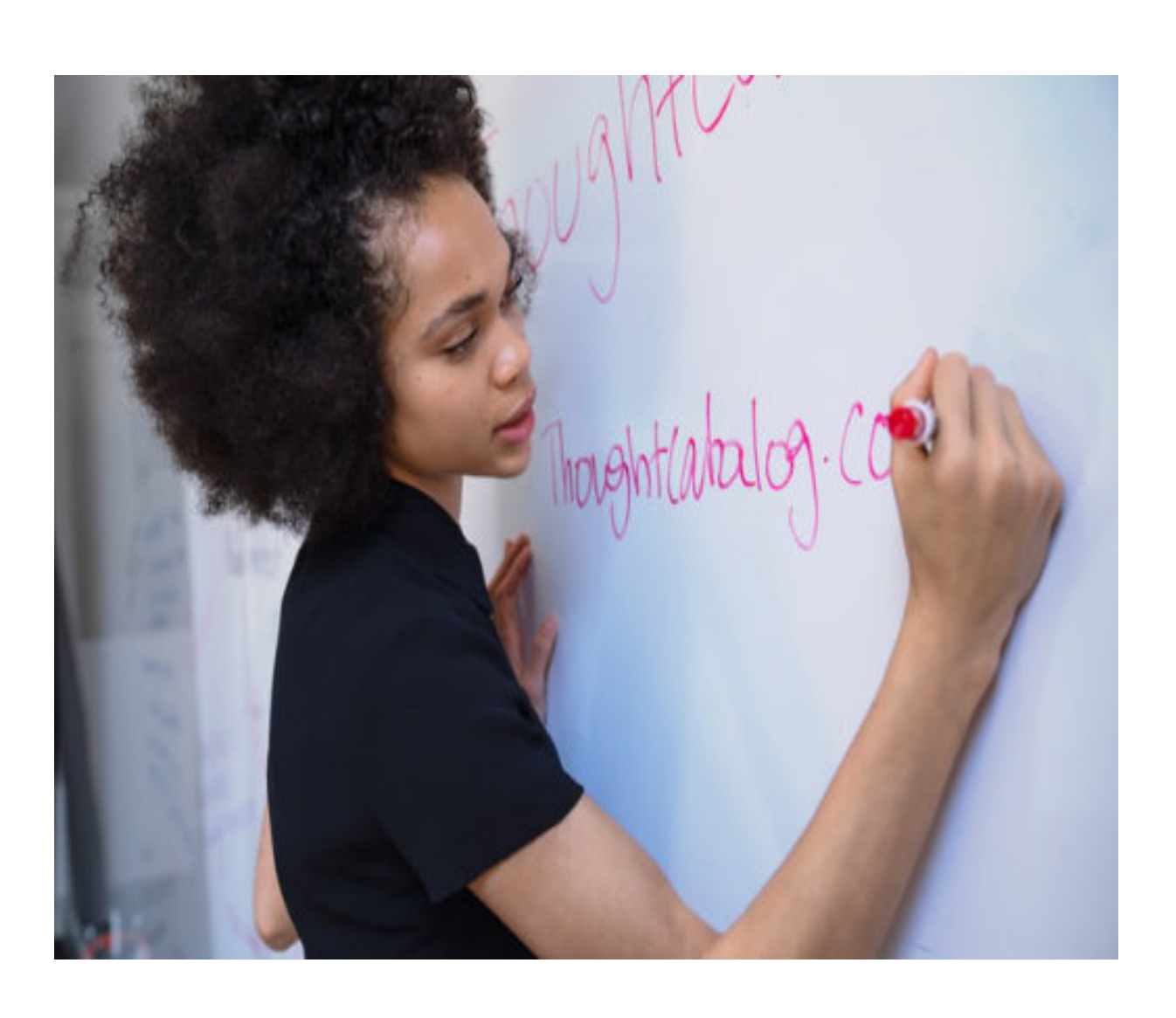
Wewe ni mwalimu.