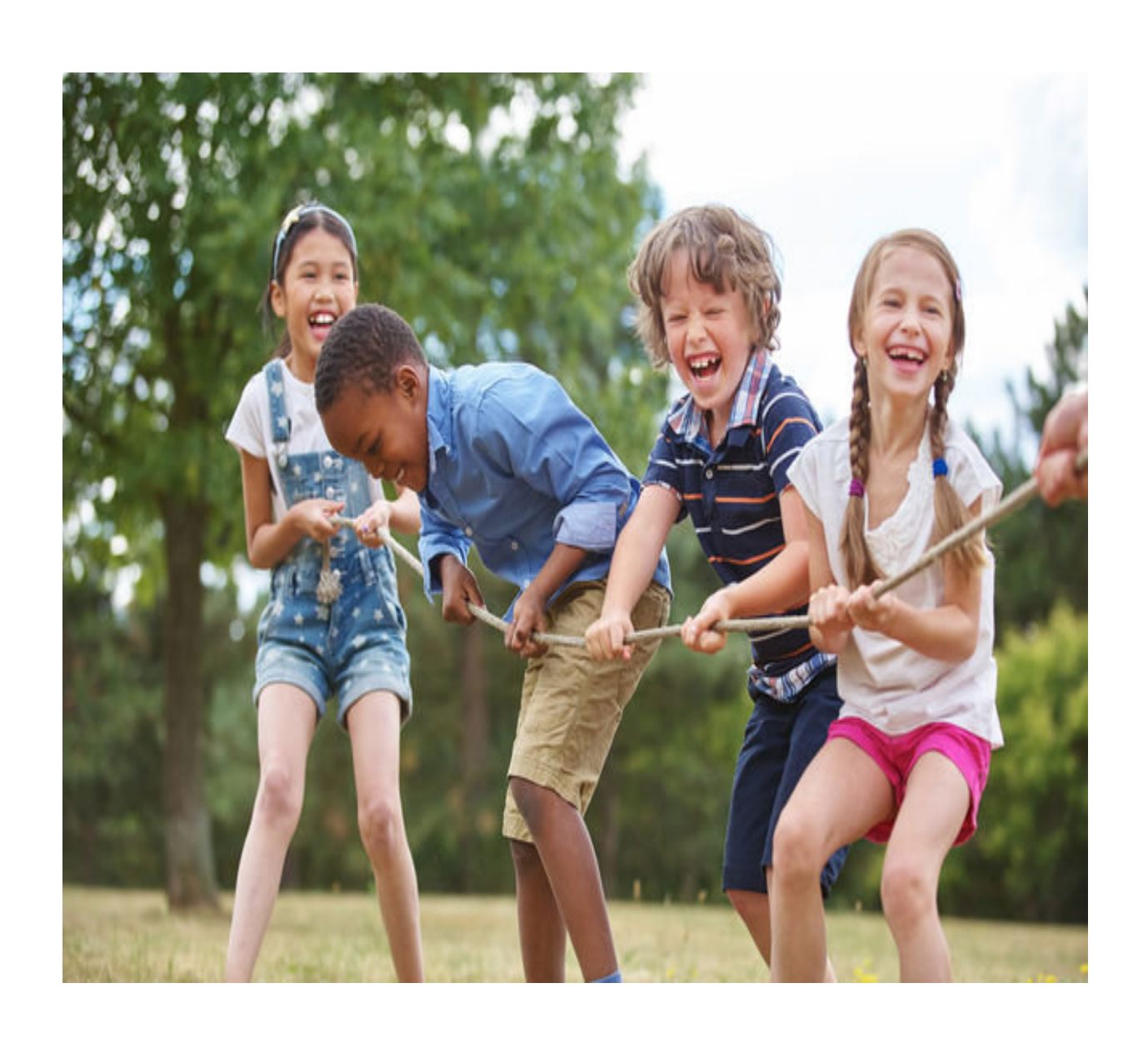
Wao ni wanaongea Kingereza. They speak English Tupendane. Tuheshimiane.

Let's love one another.Let's respect one another.