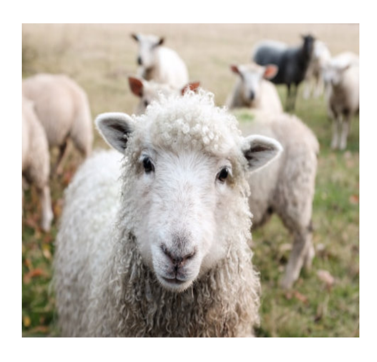
Wewe unalia, "baaaa". You make the sound, "baaaa".