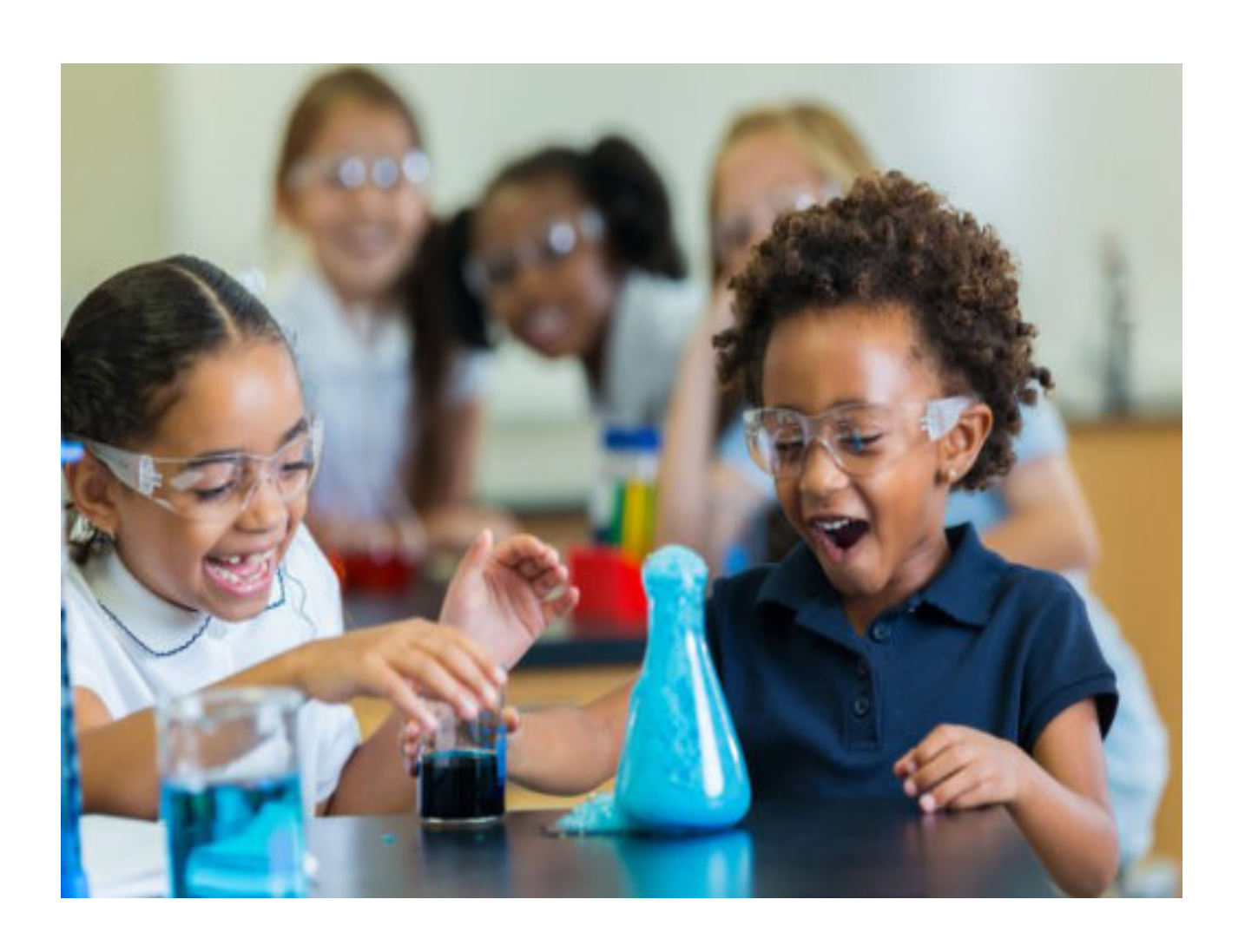
Sisi tunapenda sayansi We love Science.